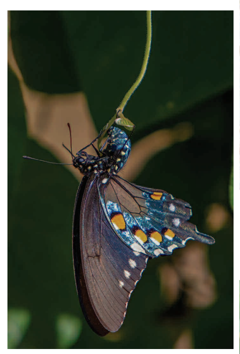
Pipevine Swallowtail ( Battus philenor ), ovipositing on pipevine ( Aristolochia sp.), 7/26/22, Wareham, MA, Andrew Griffith

Spicebush Swallowtail caterpillars (Papilio troilus) on Sassafras (Sassafras albidum), 8/12/22,Reading, MA, Ashley Gross