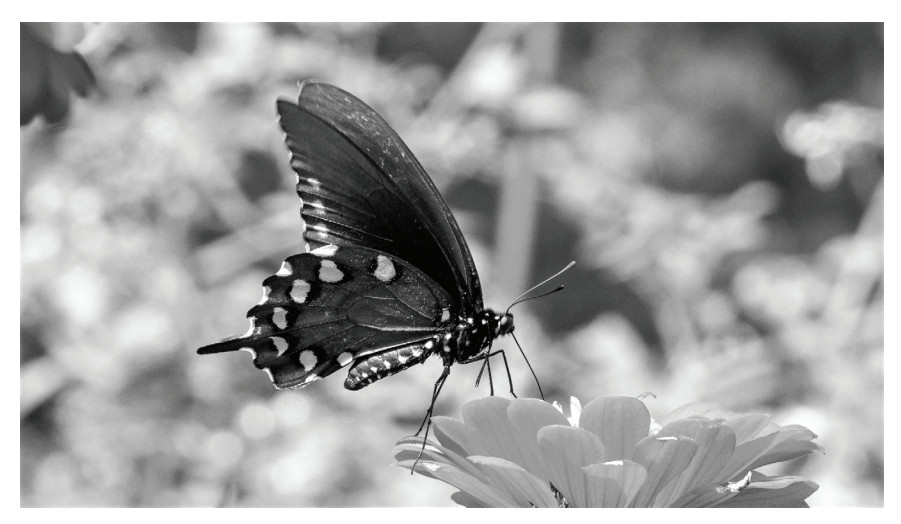
Pipevine Swallowtail ( Battus philenor ), 9/7/22, Arlington, MA, Peter Loshin

We added many other tree and plant hosts for caterpillars: birch, cherry and mountain ash for Tiger Swallowtails; a red mulberry tree for Mourning Cloaks; false nettle and Pennsylvania pellitory for Red Admirals; thistles and pussytoes for ladies; American wisteria for Silver-spotted Skippers and showy tick trefoil for Eastern Tailed-Blues and Gray Hairstreaks. We planted a still-struggling pipevine a few years ago for Pipevine Swallowtails, and hackberries for Mourning Cloaks, Question Marks and American Snouts - we're hoping but not expecting to someday see snouts here in Arlington, but we weren't expecting to see a Pipevine Swallowtail either.