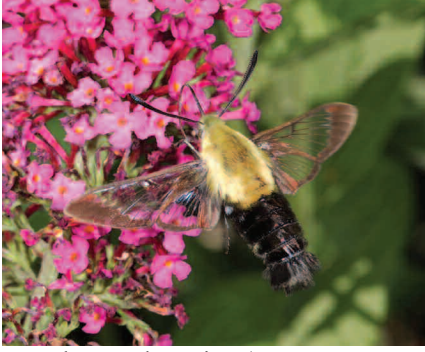
Snowberry Clearwing ( Hemaris diffinis), 7/23/22, Groton, MA