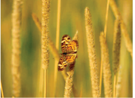
Pearl Crescent, ( Phyciodes tharos ), 8/5/22, Southboro, MA, Dawn Vesey