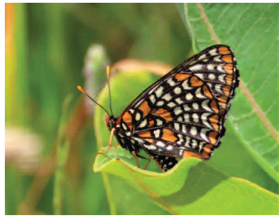
Baltimore Checkerspot ( Euphydryas phaeton), 6/29/22, Amesbury, MA