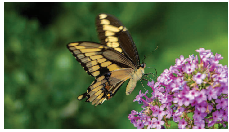
Giant Swallowtail ( Papilio cresphon tes), 8/7/22, Arlington, MA