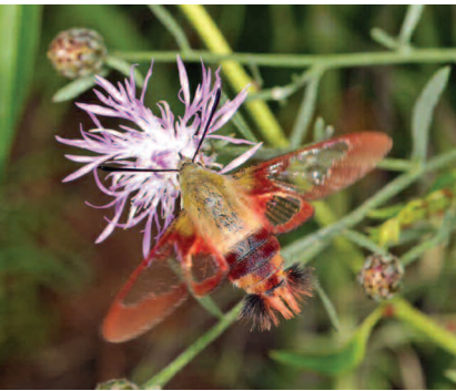
Hummingbird Clearwing ( Hemaris thysbe), 7/29/22, Groton, MA