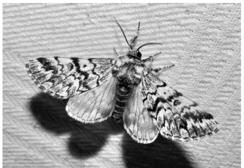
Black Zigzag Moth, ( Panthea acronyctoides),7/23/22, Chocorua, NH