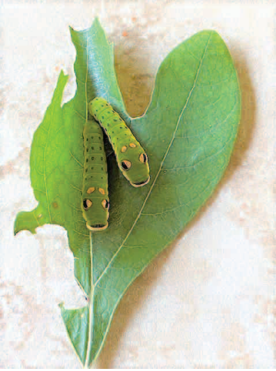
Spicebush Swallowtail ( Papilio troilus), 7/23/22, West Bridgewater, MA