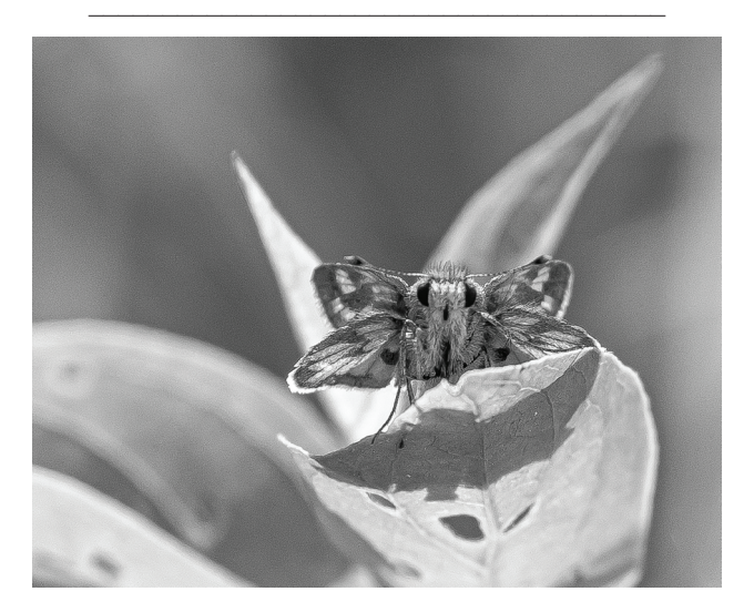
Peck's Skipper ( Polites peckius ), 6/5/22, Shrewsbury, MA, Bruce deGraaf

Cover drawing: Cecropia moth ( Hyalophora cecropia ), colored pencil on tinted paper, © William Benner, 2022